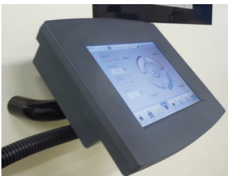
SIMPAC Precise Adjustable Touchscreen Controller