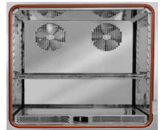
Intelligently Engineered Test Space Design for Accurate Airflow Gradients