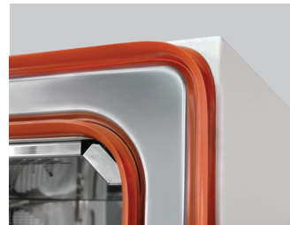
Tight Seal Double Gasket