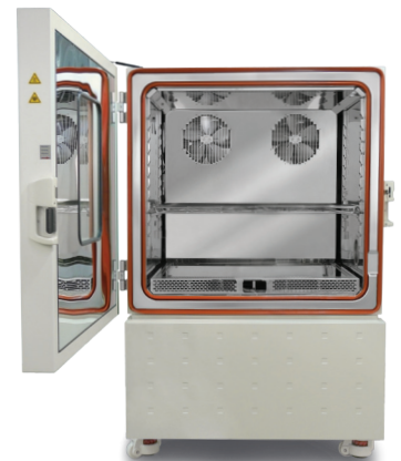
Welded Polished Stainless Steel Interior