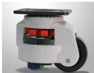
Adjustable Heavy Duty Leveling Casters