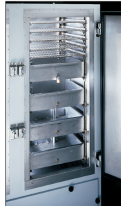
Conforms with ASTM C 511-06 test standard

The EC Series Moist Cabinet/Cement Curing Chambers are specifically designed for use in the making and curing of hydraulic cement and concrete test specimens. Combined insight into the curing process and chamber maintenance has led to many design features which add to the ease of operation, and simplify the cleaning and maintenance of this chamber.