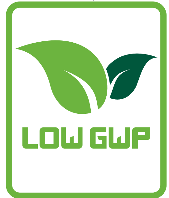
Low Global Warming Potential Refrigerants

See our White Papers on LOW GWP/R-449A Refrigerants and LEEF Technology® at www.weiss-na.com