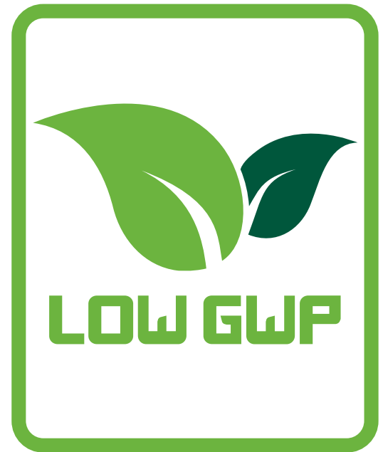
Low Global Warming Potential Refrigerants

See our White Papers on LOW GWP/R-449A Refrigerants and LEEF Technology at www.weiss-na.com