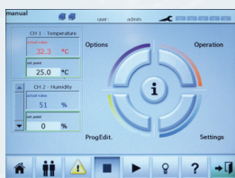
Ease of Operation