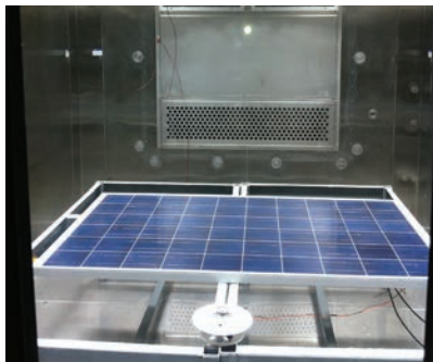
Photovoltaic Cell Testing