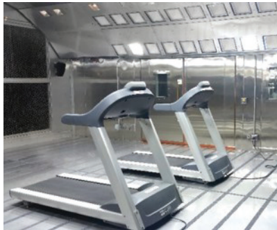
Apparel Performance Testing

The Weiss Technik WP Series walk-in/drive-in test chamber offers a modular construction, to facilitate move-in and installation. The WP Series is well suited for many testing applications and offers a wide selection of performance features.