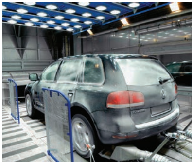
Full Vehicle Testing Combined Temperature/Humidity/Lights/Dyno