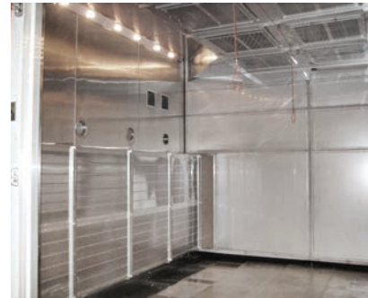
Custom Electronics Testing